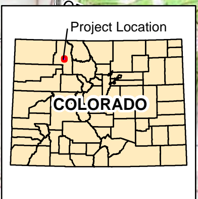
Exhibit A Project Location

Peabody Trout Creek Reservoir LLC Trout Creek Reservoir Project Routt County, Colorado